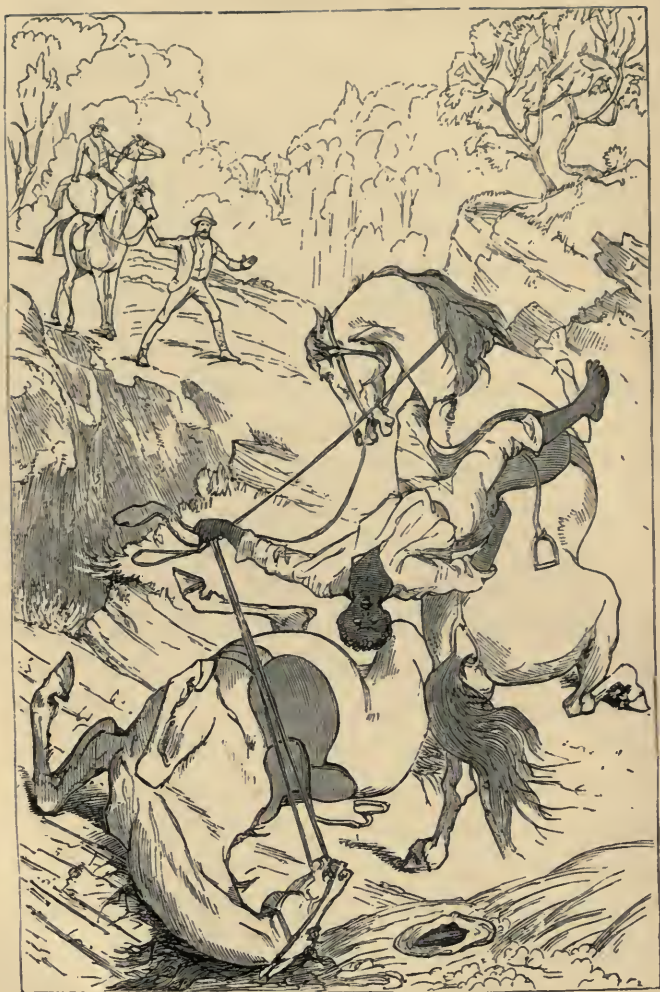
CROSSING A "DRIFT."—PAGE 129.